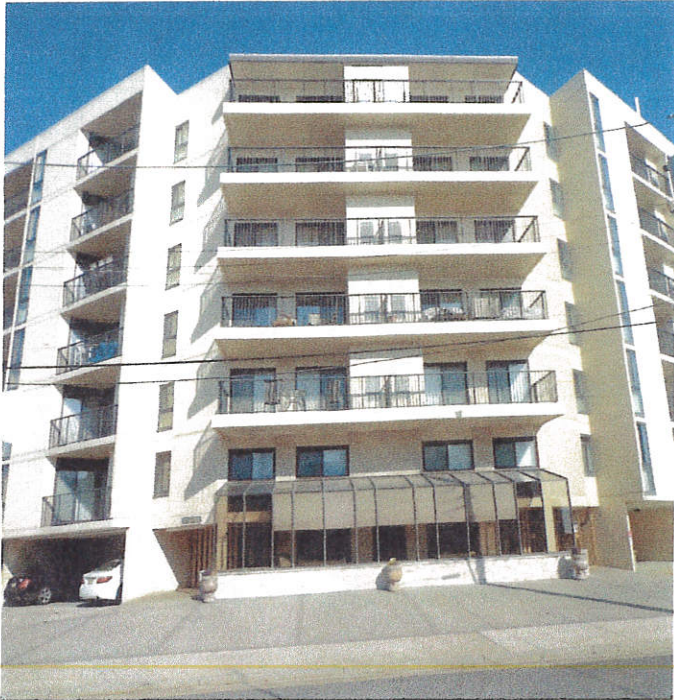
Front View Date Taken:12/03/2012